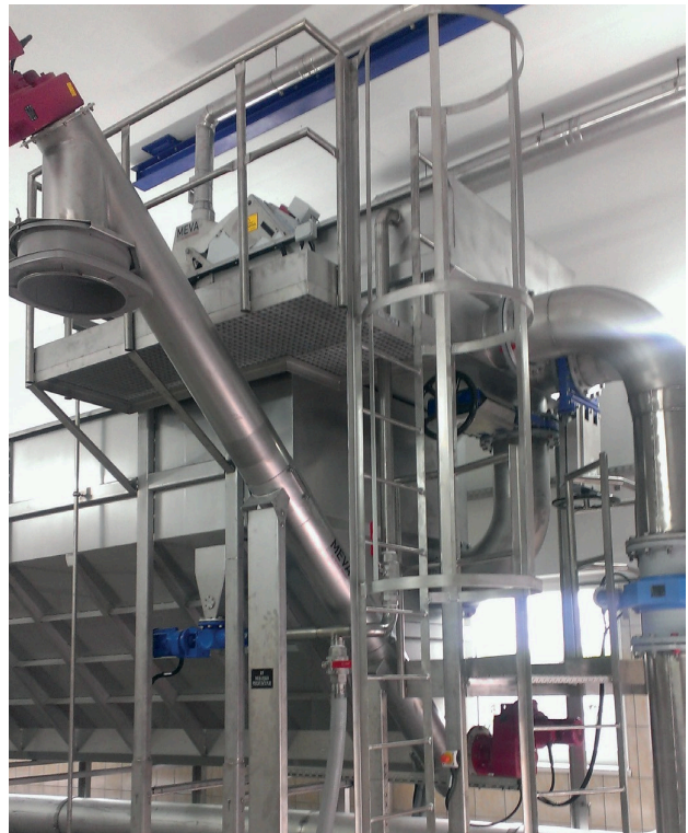
The robust combi unit can be installed indoors or outdoors