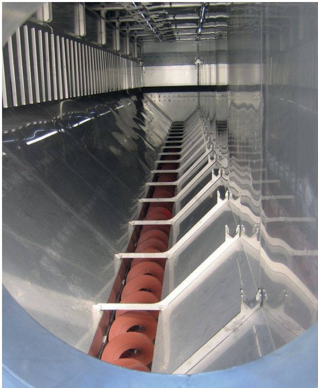
View of the inside