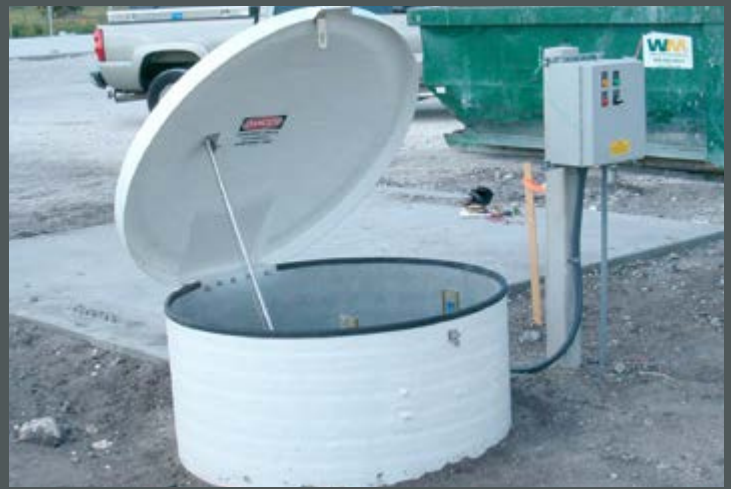
Hatch access door to MIM (street manhole option also available)