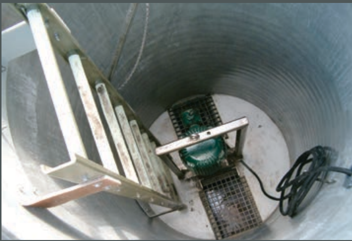
Top view of Monster Industrial Manhole