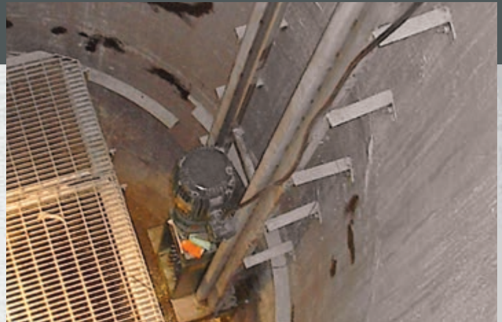
Guide frame and grinder