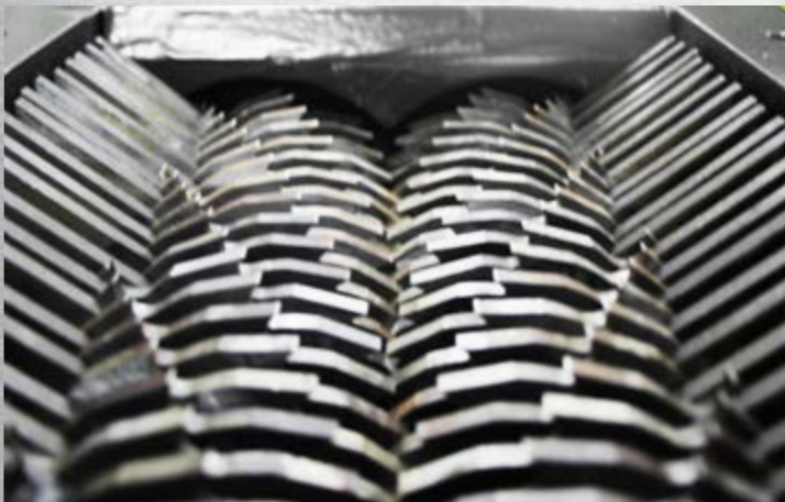
A close view of the cutters