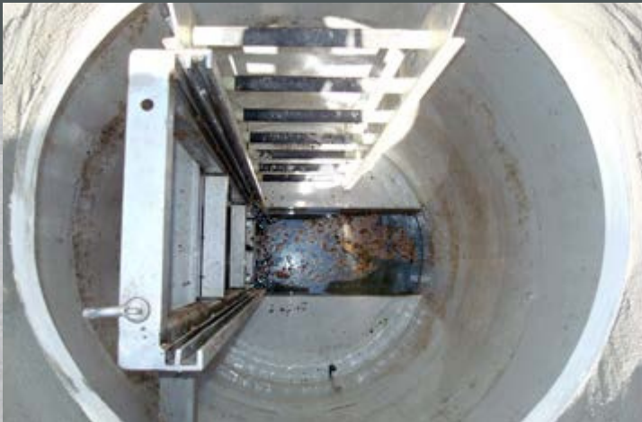
Guide frame and access ladder Inside the MIM (the grinder has been removed)